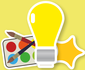
Received thousand of INSPIRING IDEAS