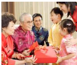
Use good-as-new notes, instead of brand-new ones, for lai-see

As well as celebrating with auspicious food, strings of red lanterns and generous gifts, this year you can also help reduce the impact on the environment by following our green CNY advice: