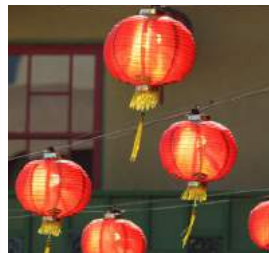
Store decorations for reuse in the following year