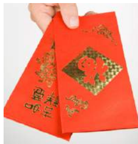
Reuse lai-see packets