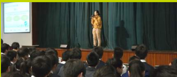
A Samsung employee speaks with students at TWGH Lee Ching Dea Memorial College about how technology can be used to solve environmental issues.

The Samsung team has been hard at work hosting assemblies and workshops at schools in Hong Kong. This program gets students thinking about issues facing the city's environment – and more importantly, inspires them to think about how they can use technology to make Hong Kong a greener, smarter place to live.