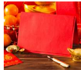
Send e-cards instead of paper greeting cards