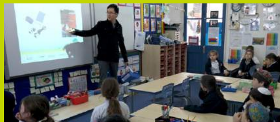
Students from Carmel School of Hong Kong examine how technology has been used to solve environmental issues during a visit from a Samsung employee.

"Samsung Solve for Tomorrow is a great program for students because it encourages them to take action in protecting the world that they live in. I believe that the environment is something that they should be aware of."