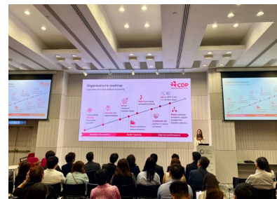
May 2024 - Harnessing the Power of Corporate Climate Disclosure