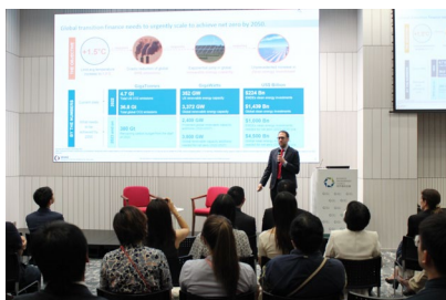
Jun 2023 - Transition Planning and Scaling Transition Finance

Our events strengthen signatories' understanding of the “ why ” and “ how ”, enabling them to commit to and achieve ambitious, science-aligned targets and leverage opportunities .