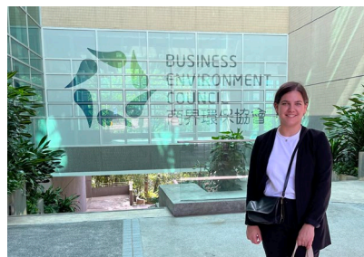
Nov 2023 - SBTi Technical Building Manager's Session